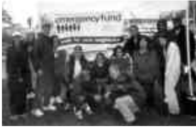
Associate Board volunteers gather to celebrate a wet, but worthwhile, event.